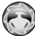
British Columbia Centre of Excellence for Women's Health

For the full report or the policy brief, contact the British Columbia Centre of Excellence for Women's Health at bccewh@cw.bc.ca .